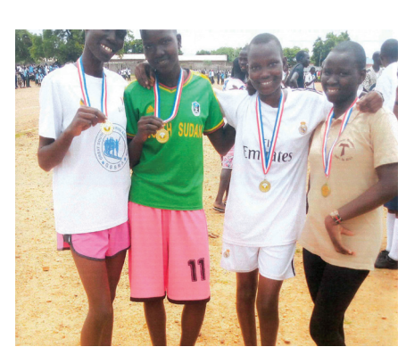
The winning girl team in the 4 x 400m relay

The registration of 138 candidates for the next School Certificate examinations to be held in December 2019 is another milestone in the success of JDMSS. This is the largest number of students to be presented in the life of the school to-date and illustrates that a growing number of parents see the value of this School Certificate in securing a better future for their children. We hope that this success will continue.