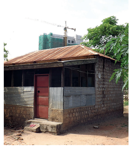
The proposed new house for the Headmaster is undergoing refurbishment